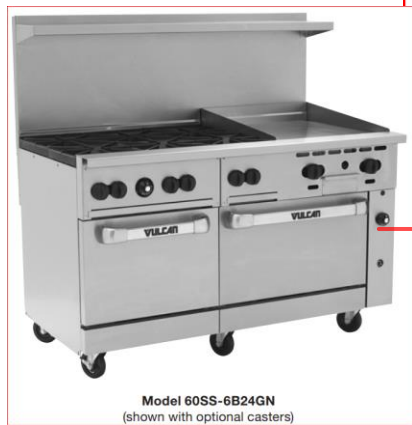
6 Burner Gas Stove with 24" Griddle & 2 Ovens

Model 60SS-6B24GN (shown with optional casters)