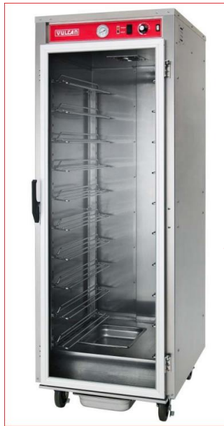
Heated Proofer cabinet