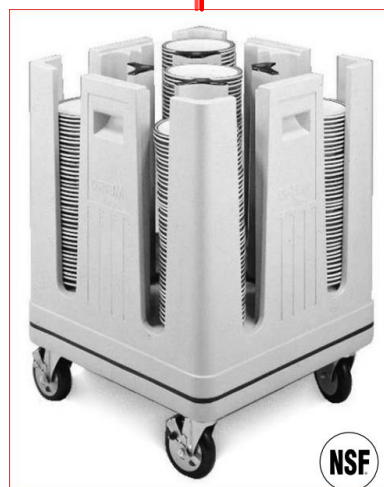
Multiple Poker Chip dollies for plates

Model 60SS-6B24GN (shown with optional casters)