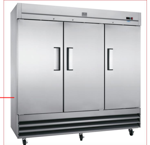
72 ft 3 Freezer