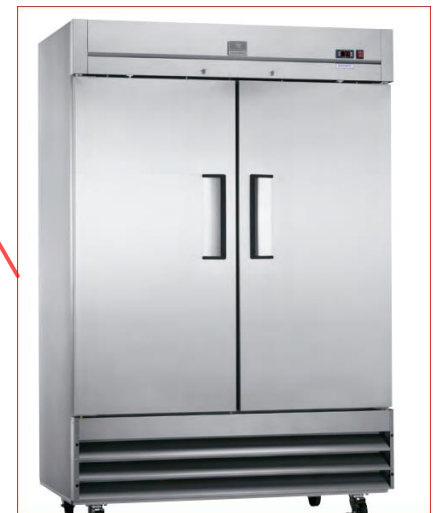
48 ft 3 Refrigerator