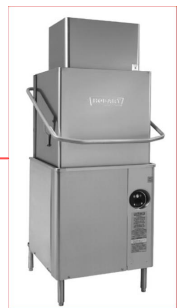
Ventless dishwasher 40 loads/hr