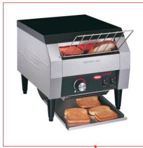
Toaster 300 slices an hour