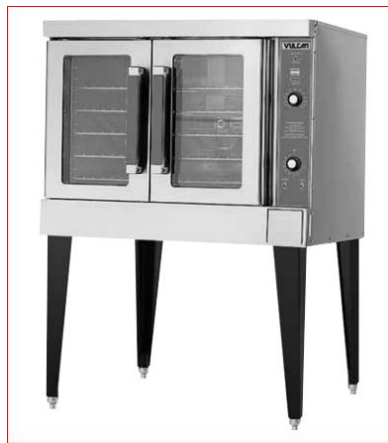
Gas Convection Oven